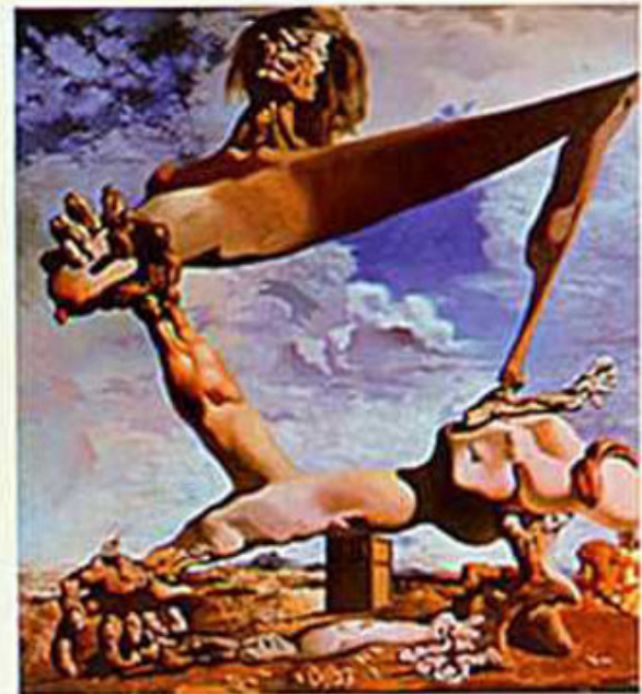
Salvador Dalí SOFT CONSTRUCTION WITH BOILED BEANS